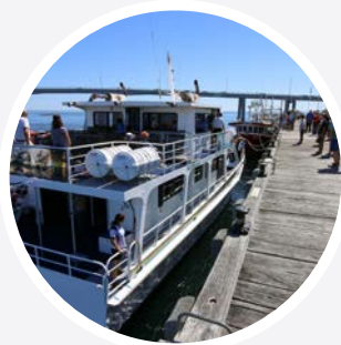
San Remo Jetty 170 Marine Parade, San Remo