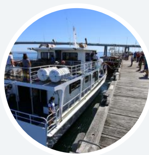
San Remo Jetty 170 Marine Parade, San Remo