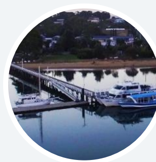
Rhyll Jetty 16 Beach Rd, Rhyll