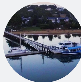
Rhyll Jetty 16 Beach Rd, Rhyll