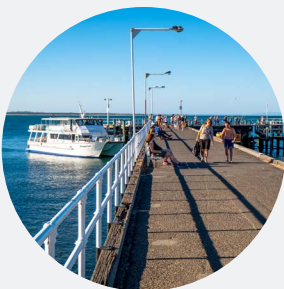
Cowes Jetty 11/13 The Esplanade, Cowes