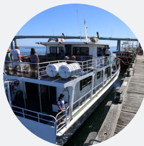
San Remo Jetty 170 Marine Parade, San Remo